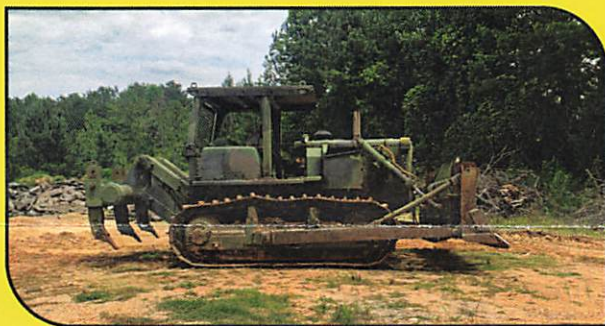
D7F - #71 MODEL COMPLETE OVERHAUL 61G00218-R

Heard County Arena, 12080 GA HWY 100, Franklin, GA 30217