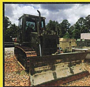
CASE MC1150 95 HOURS JAK0012683

To View Auction Items go to www.auctionzip.com