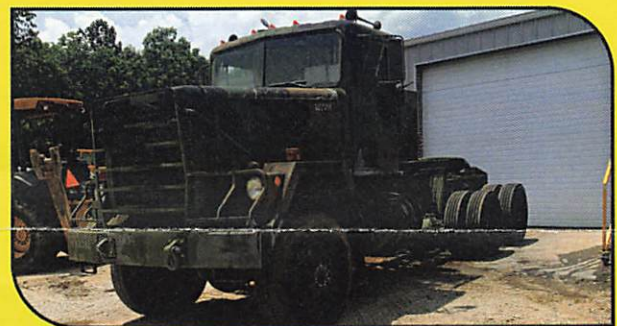
G.I. TRUCK 2645 MILES 6-WHEEL DRIVE