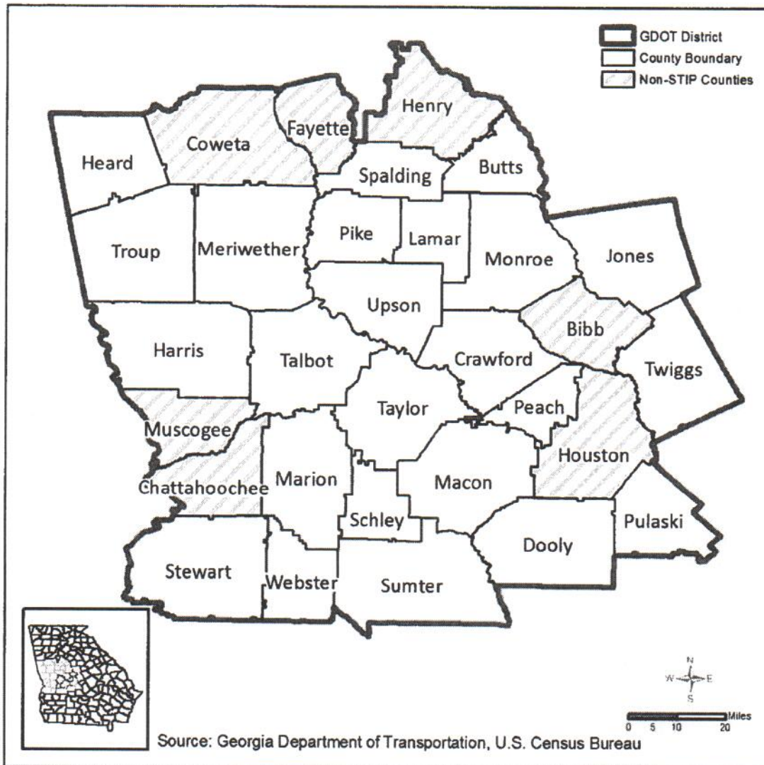
Figure 20: District 3